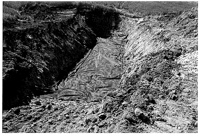
6/11: Sinkhole excavation and geotextile.

Due to rainy weather, final grading, seeding, and installation of the trash rack was completed on June 25.