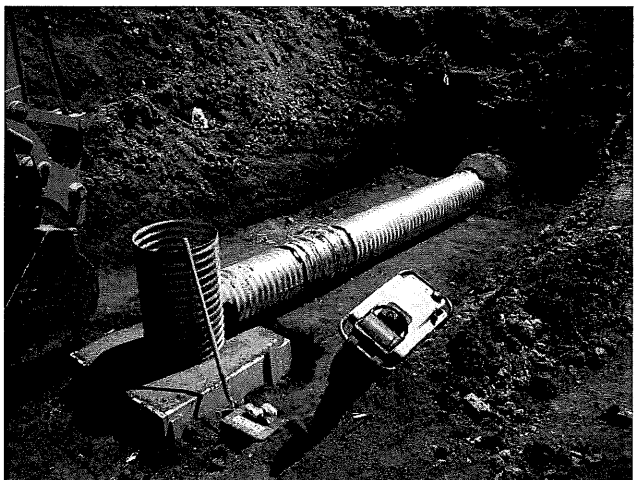
6/13: New riser and pipe grouted into concrete.