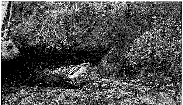
6/12: Excavation of existing drawdown pipe.