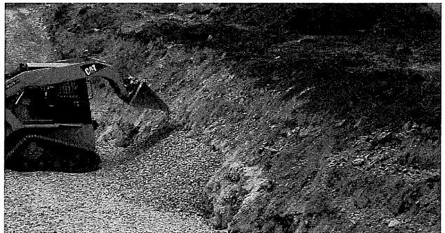
6/12: Medium drain material placement